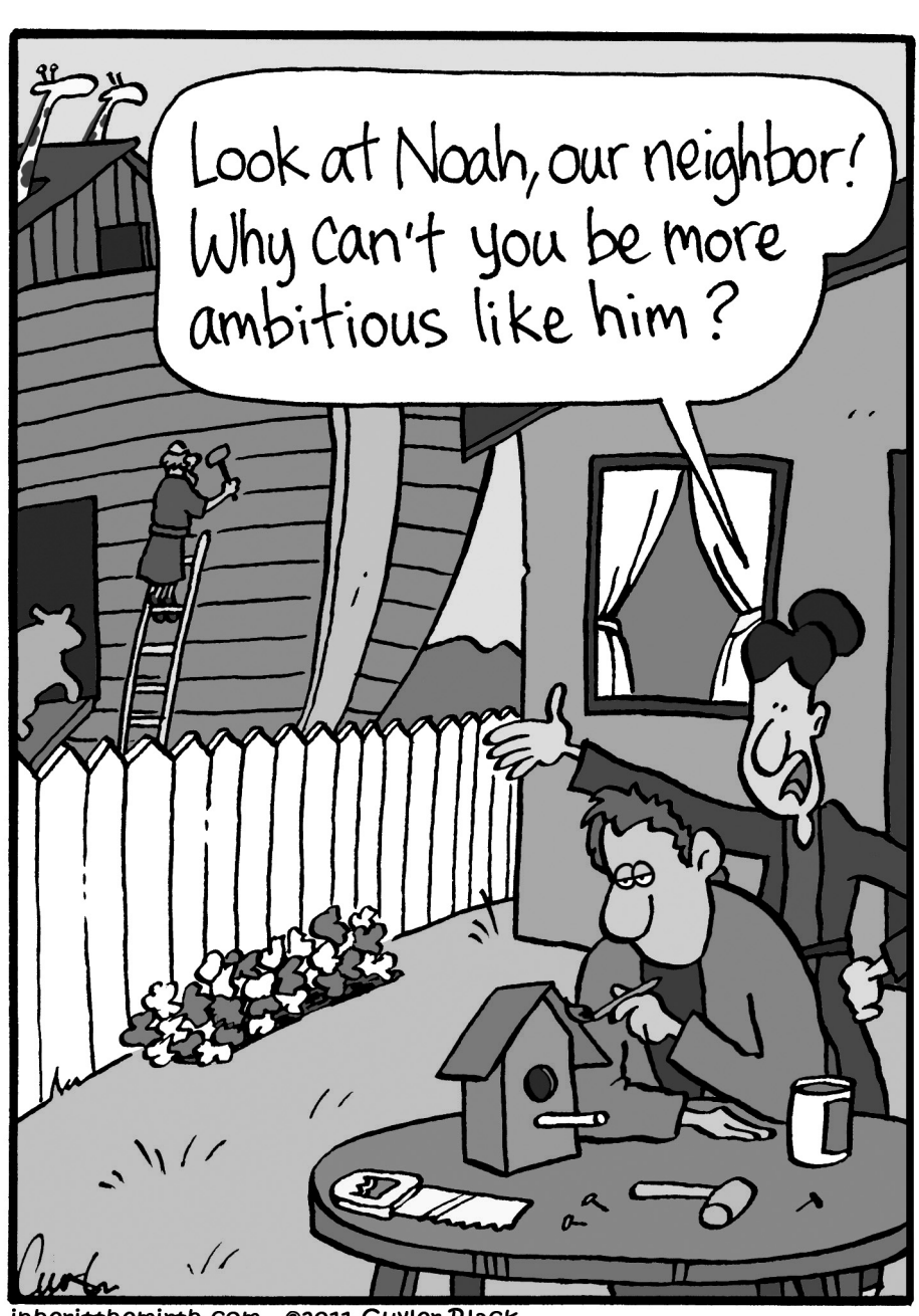
inheritthemirth.com ©2011 Cuyler Black