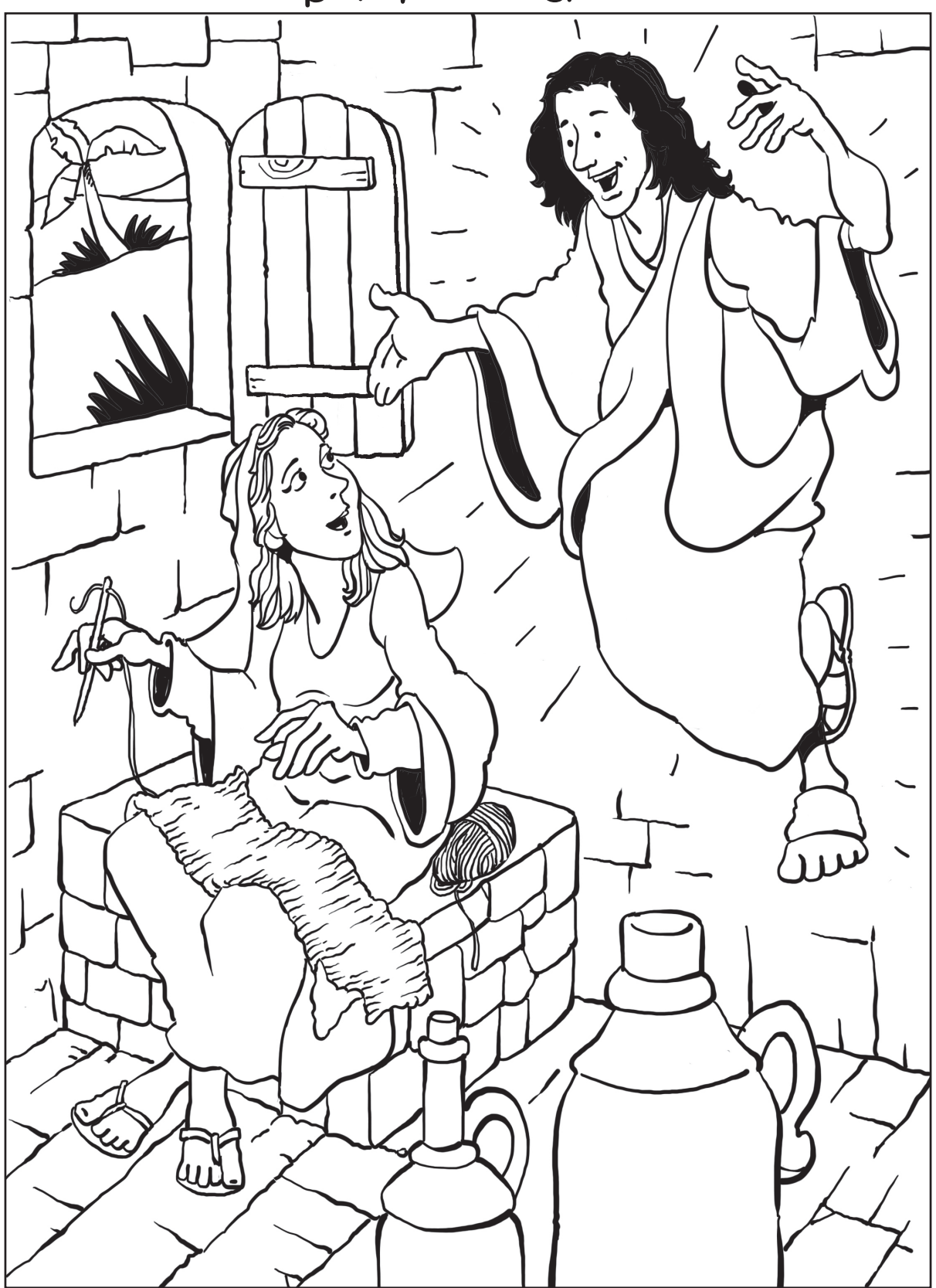
Mary says, "Yes!" to the message the angel delivered from God.