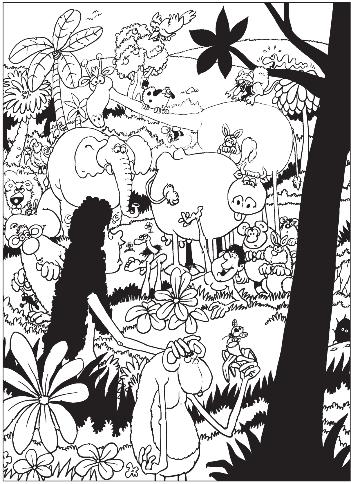
God creates Adam and Eve to care for God's creation.