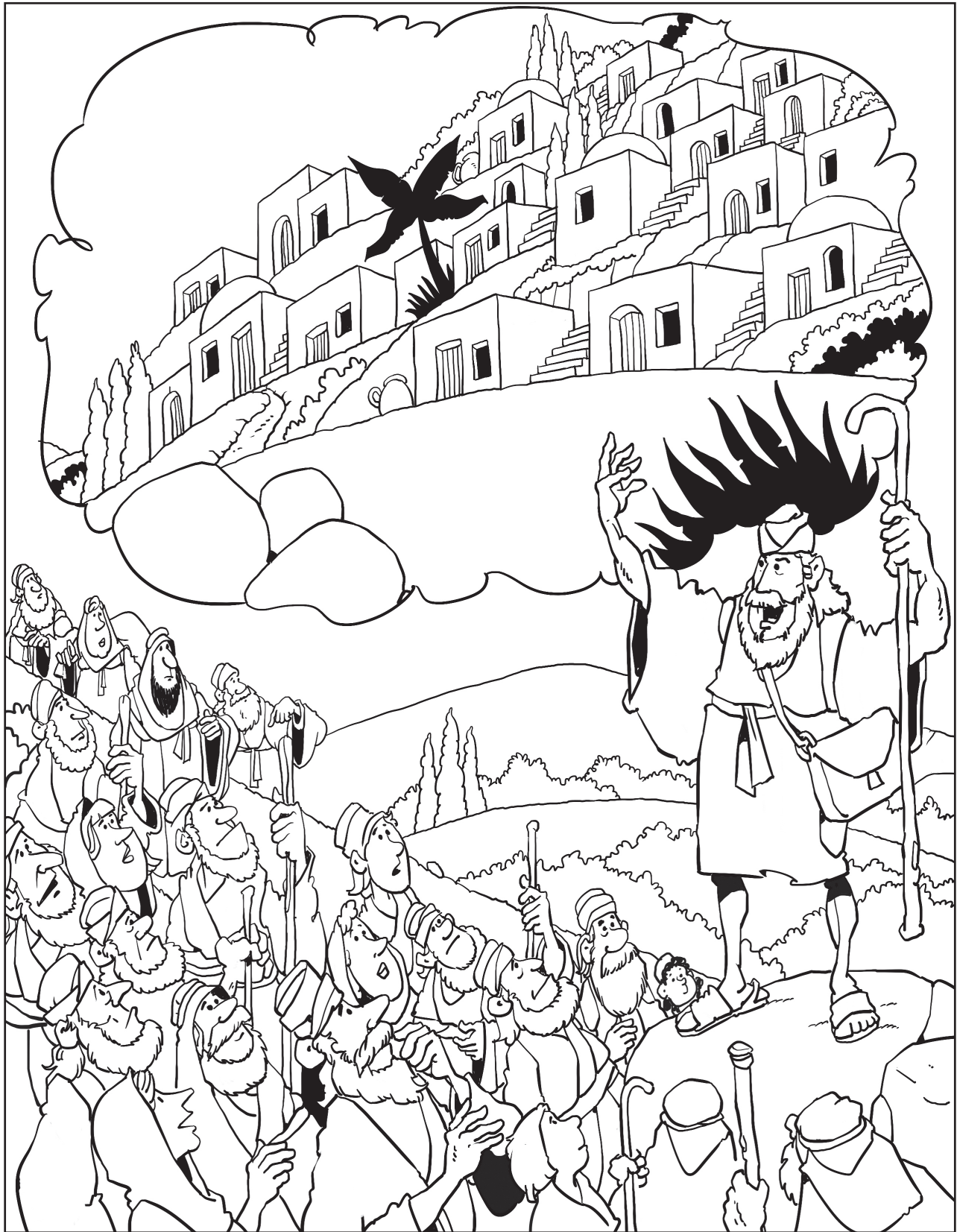
Micah tells the people that God's peace will come from Bethlehem.