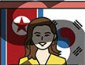
Queen Aiko, 1912 The first Japanese empress to visit the United States.