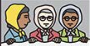
Abolition de l'Esclavage, 1872 The abolition of slavery in the French colonies and the United States.