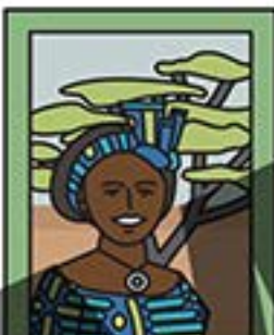
Wangari Maathai, 1940-2011 The environmental activist and leader of the Green Belt Movement in Kenya.