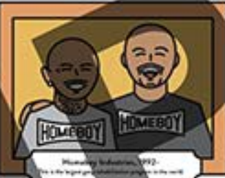
Homeboy Industries, 1992 The organization that helps former prisoners find jobs and housing.