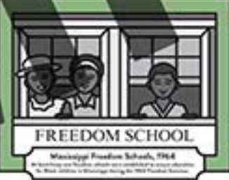
Mississippi Freedom Schools, 1964 The first time that African American children were allowed to attend school in Mississippi during the Civil Rights Movement.