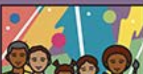
Philadelphia World Arts Project, 1986 The project to promote art and culture in Philadelphia.