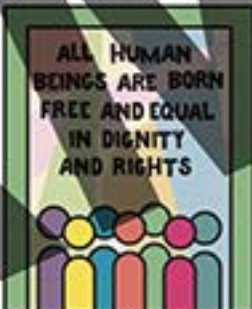
Universal Declaration of Human Rights, 1948 The first time that all human beings were recognized as having the same rights and freedoms.