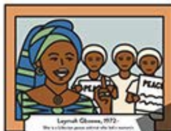
Laymah Ghouse, 1972 The first woman to be elected to the United States House of Representatives from the Middle East.