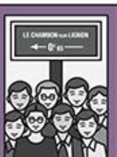
Le Chantier du Lignon, since 1942 The community garden in Belgium during World War II.