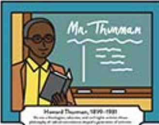
Howard Thurman, 1899-1951 The man who wrote about the importance of the inner life and the power of prayer.