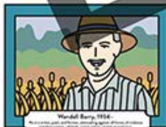
Wendell Berry, 1914 The author and farmer who wrote about the importance of the land.