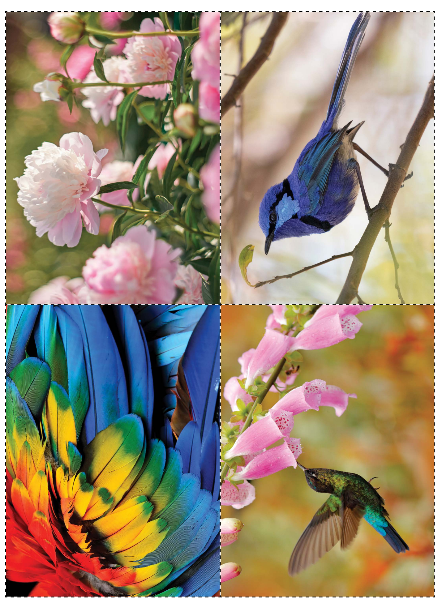
Young Children: Session 1—See Joy in God's Creation © 2022 Growing Faith Resources