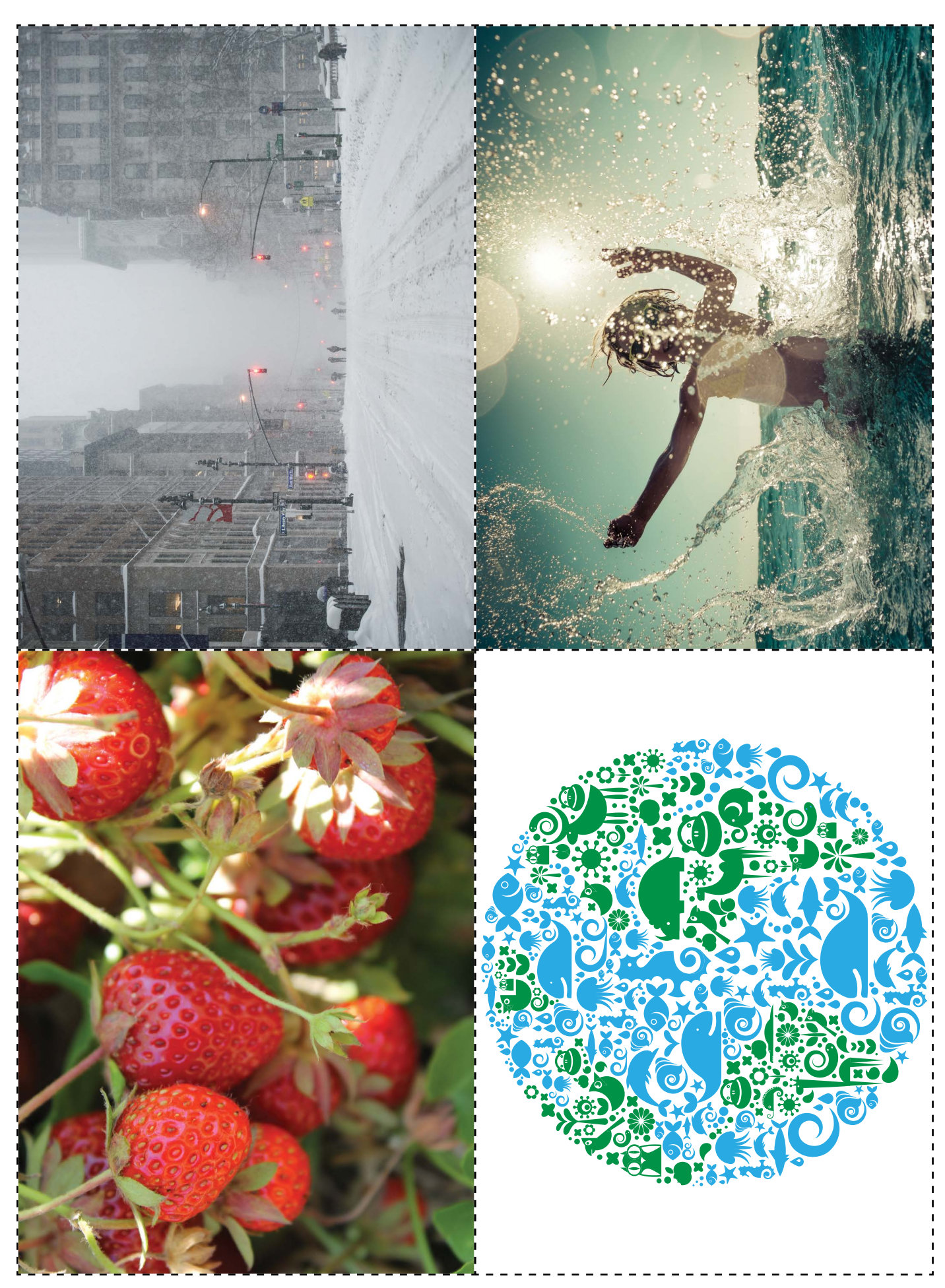
Young Children: Session 1—See Joy in God's Creation © 2022 Growing Faith Resources